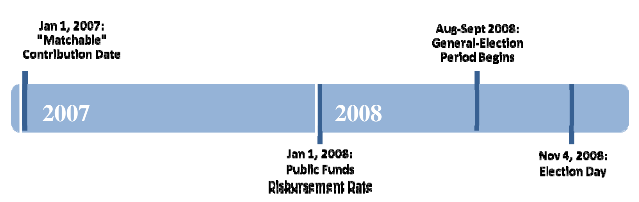
Figure A: Current Presidential Public Funding System—Significant Dates 177

Proposals for System reform nearly all advocate moving the FEC's disbursement date earlier than January of the presidential election year in order to make public funding more attractive to candidates. 178 A reform package publicized in 2005 and written by then-FEC